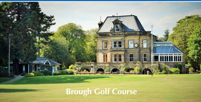
Brough Golf Course