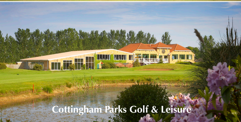
Cottingham Parks Golf & Leisure