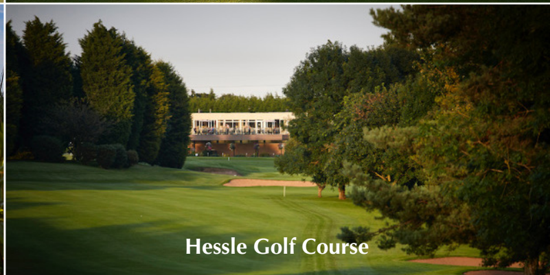
Hessle Golf Course