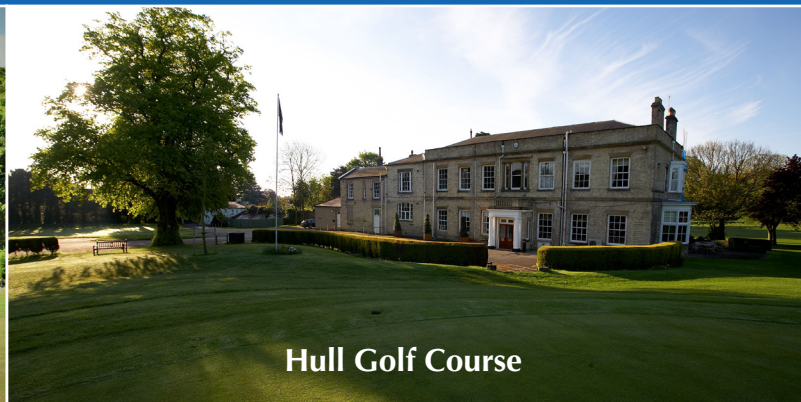
Hull Golf Course